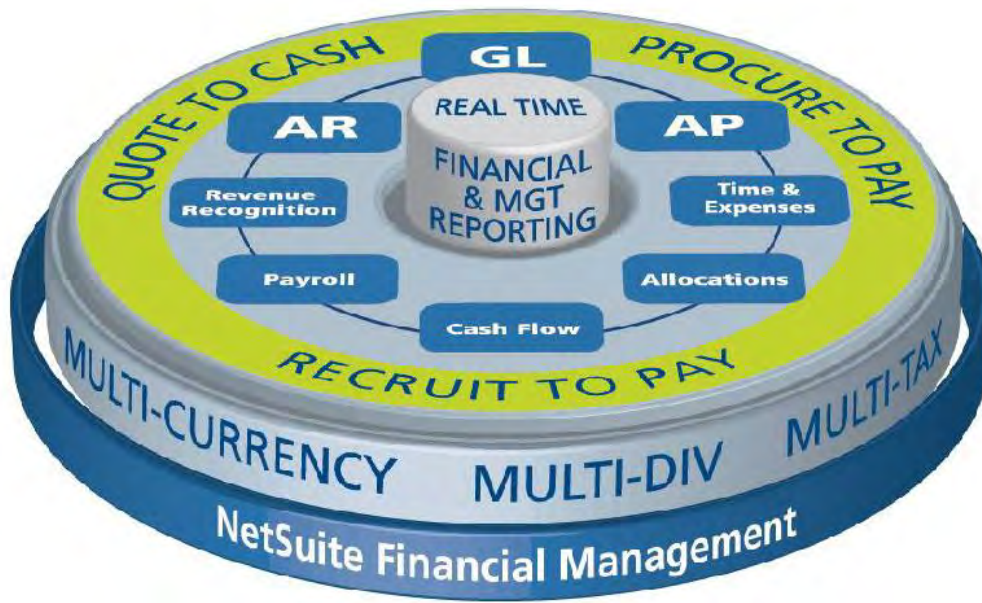
Figure 3. NetSuite OneWorld: Complete Global Financial Management

NetSuite OneWorld brings global capabilities to the service provider's core offering of ERP and financial management services. Out of the box, NetSuite OneWorld provides support for 19 languages and more than 190 currencies, and tax reporting support and certification for more than 50 countries. Backed by a global partner network, NetSuite OneWorld also supports transactional and use taxes for more than 110 countries, and can manage multiple subsidiaries with distinct tax years and reporting dates. As shown in Figure 3 , NetSuite OneWorld provides comprehensive capabilities to address a wide range of global financial management requirements.